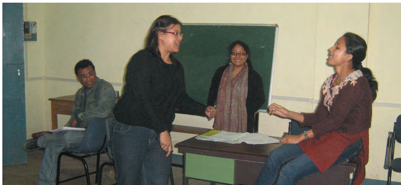
ELT students doing Role Play as an effective language teaching methodology

The Department of English Language Teaching is located in the two-storeyed building behind the Department of Business Administration and to the western side of the Department of Education (please refer to B2 in Map 1).