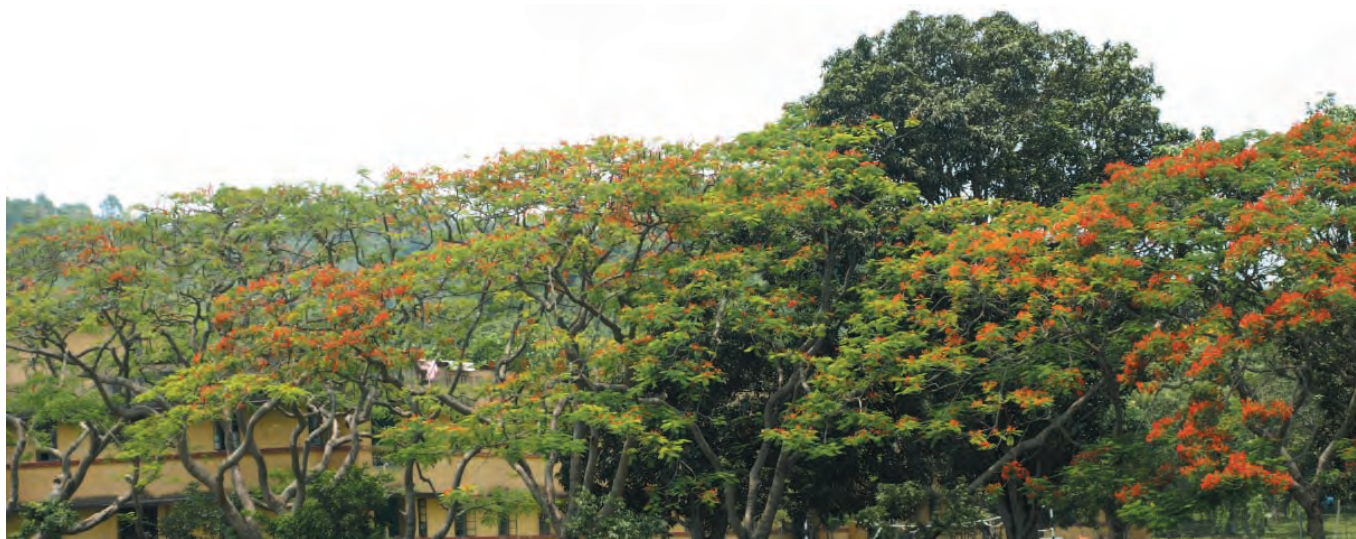
A GU hostel in lush sylvan setting

The Department of Foreign Languages is located in an Assam-type house that is situated to the south of the Main Arts Building, along its left wing. It can be reached from the northern entrance of the Main Arts Building or alternatively, from the path leading from the eastern end of that building. (Please Refer to Map 2 ).