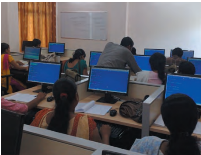
Students at work in the computer lab of IDOL