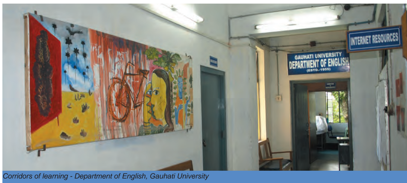
Corridors of learning - Department of English, Gauhati University