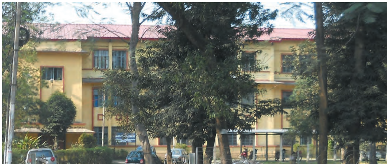
A view of the Department of Biotechnology

The Department of Biotechnology is housed in the right wing of a three-storeyed building situated to the west of the K.K. Handiqui library. (please refer to A1 in Map 1).