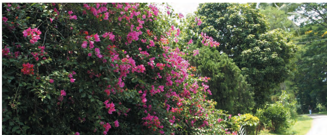
Gauhati University Campus - a floral view

The Department of Education is located to the south of the Faculty House and the MBA Department (please refer to B2 in Map 1).