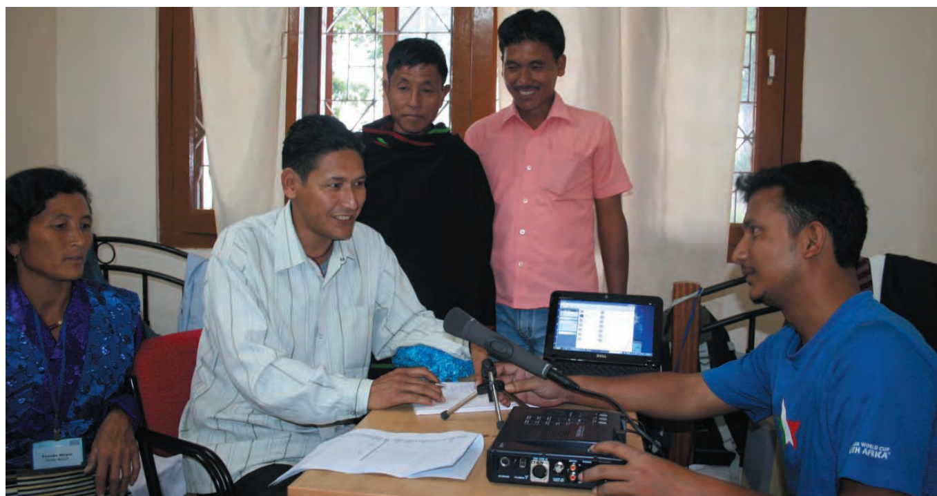
Linguistic Fieldwork on Meyor - an endangered language of Arunachal Pradesh

The Department of Linguistics is located in the two-storeyed building behind the Department of Business Administration and to the western side of the Department of Education (please refer to B2 in Map 2 ).