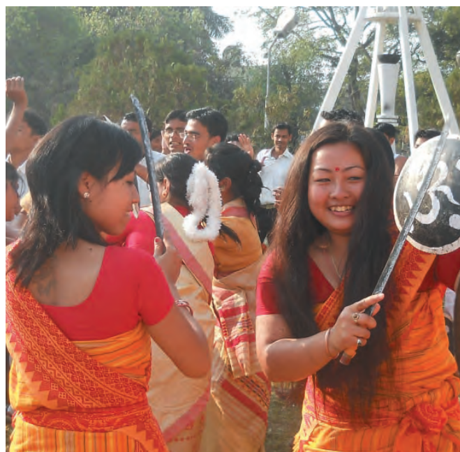
Boro Students participating in a GU cultural event