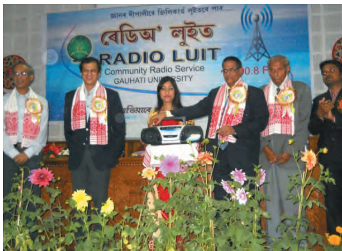
The opening ceremony of Radio Luit

RADIO LUIT , the Community Radio Station of Gauhati University has been set up and stationed at the Institute of Distance and Open Learning, Gauhati University. The station was launched on 1st March, 2011 and operates at 90.8 FM daily from 8AM to 8PM. Last year, Gauhati University obtained the license and frequency 90.8 FM from the Ministry of Information and Broadcasting, Government of India for establishing the Community Radio Station in its campus.