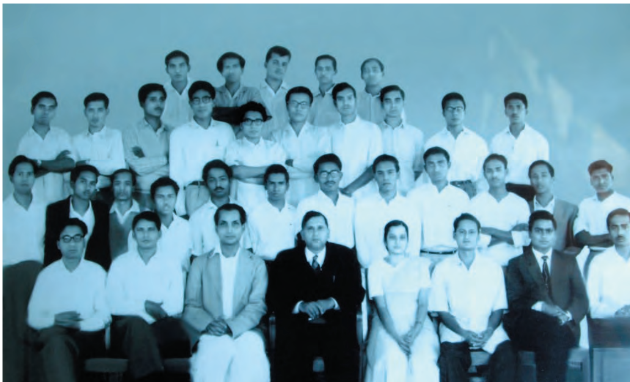
An archive photograph of teachers and students of the Mathematics Department in the early 1960's

Computer Algebra (Mathematica), 80 marks