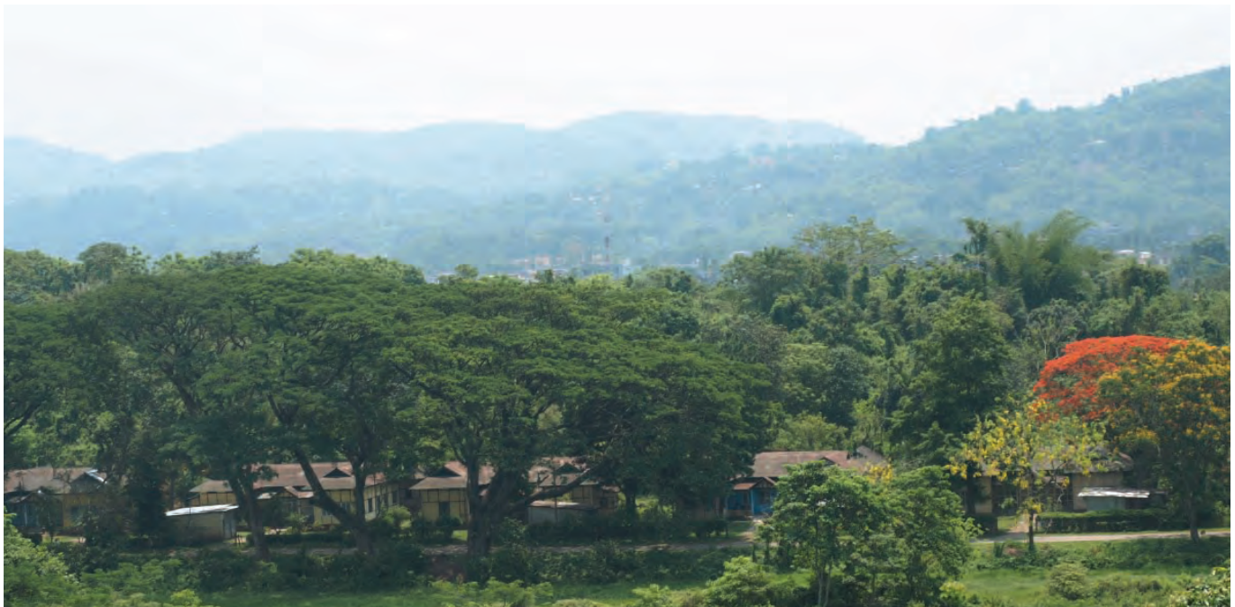
An aerial view of Gauhati University Campus

Students who have passed from this Department are serving in various Govt. and Non Govt. Organisation in Assam, as Psychologist, Psychological counsellors, teachers and officers. Some such organisations are N.F. Railway, B. Barooah Cancer Institute, Gauhati Medical College, Assam Medical College, Silchar Medical College, LGB Regional Institute of Mental Health, Regional Nursing College, NIPCCD, State Hospitals, Private Hospitals, Blood Banks, Department of Social Welfare, Dibrugarh University, Colleges, Schools, Assam State AIDS Control Society, etc.