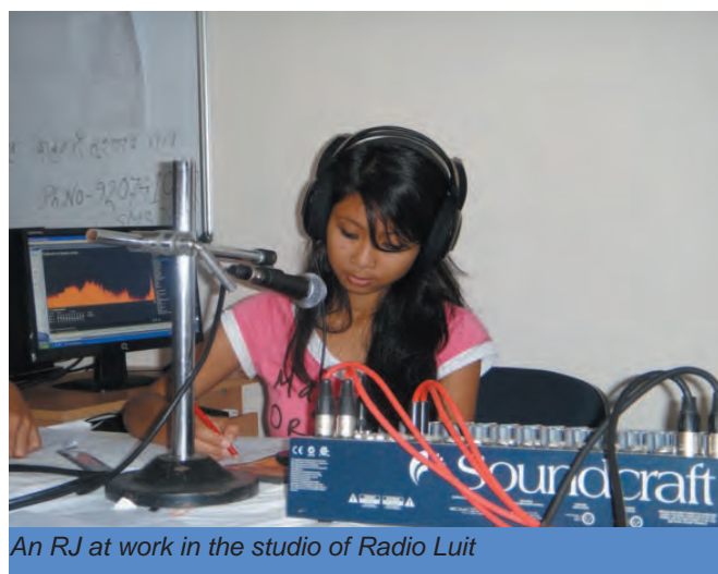
An RJ at work in the studio of Radio Luit